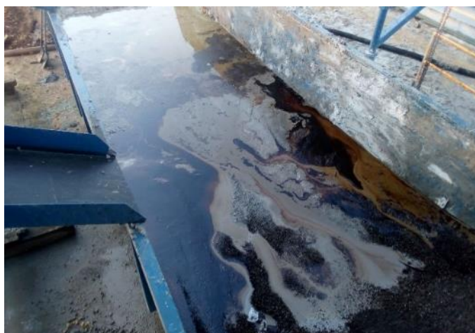
Figure 1 – Oil in the cuttings box at Alameda-1

The oil appears to be lighter than that normally seen at this depth, supporting Melbana's model of drilling in areas where higher source maturity may be expected.